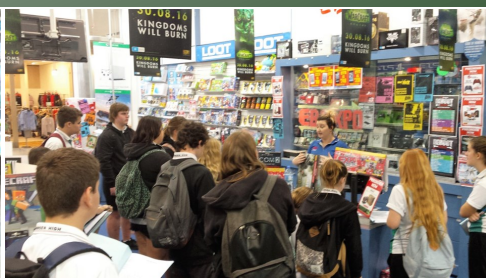
Discussing marketing and sales strategies Supervisor at EB Games