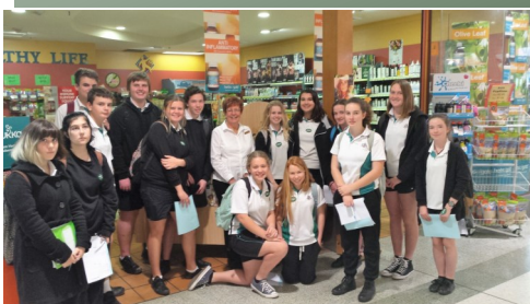
With Business Owner of Healthy Life franchise