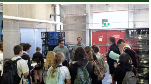
Discussion of the new concept store